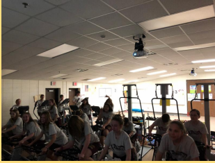
Spinning in fitness class