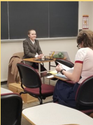
History day State