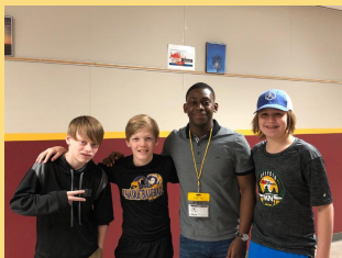
Green Card Voices Visits East