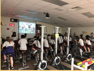
Spinning in fitness class