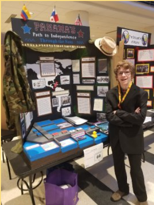
History day State