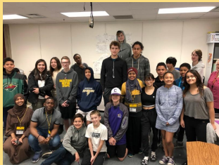
Green Card Voices Visits East